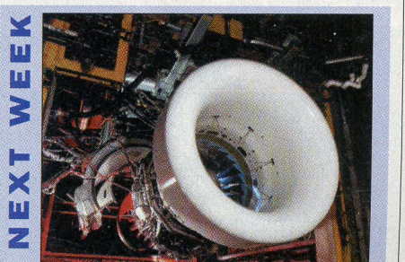
A Flight International cutaway drawing and updates on new engine programmes power a propulsion special.