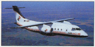
Air Vallee launches new 328JET service - P14