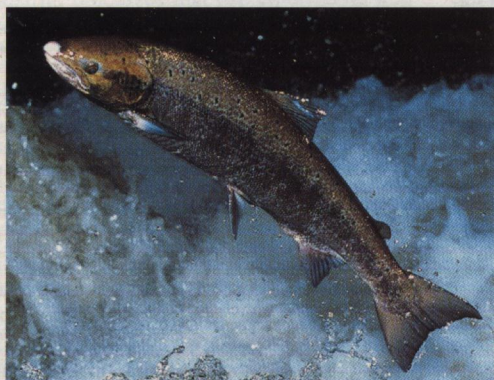
Improving fish stocks, p311