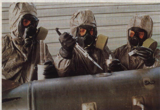
Will the US ratify the chemical weapons convention? p326