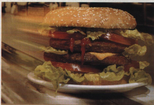
Could eating beef burgers help us lose weight? p464