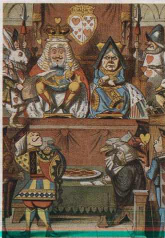
Looking-glass legislation at the EPA, p490