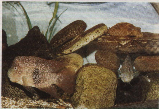
Investigating biofilms, p682