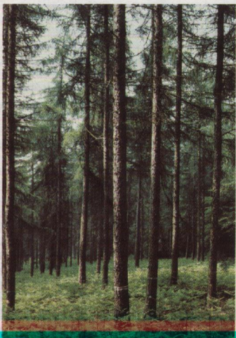
New ways to preserve wood, p720