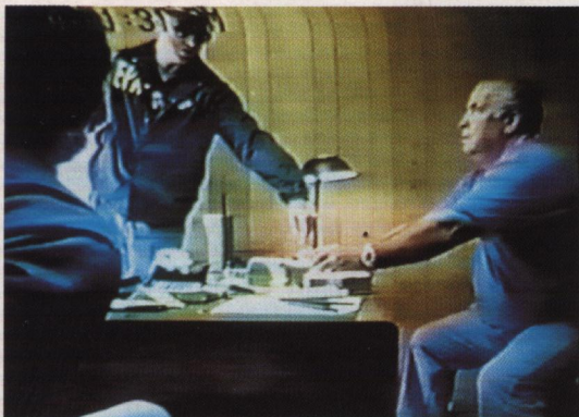
CFC smugglers exposed, p709