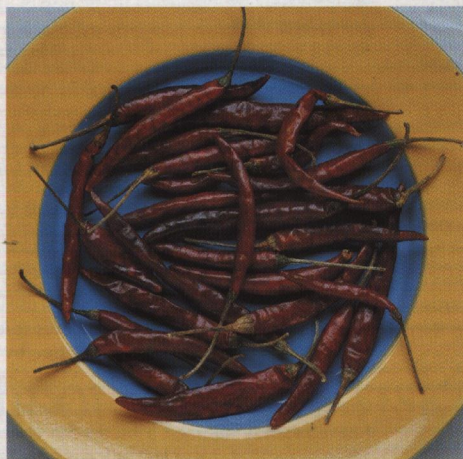
Do chillies hold the key to pain? p851