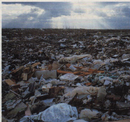
US waste data sparks war of words, p409