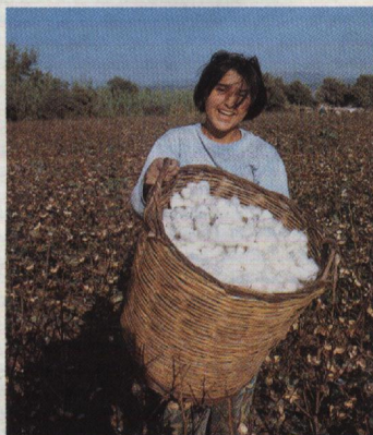
Novartis cottons on to Merck's crop protection business, p410