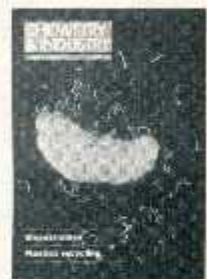
Cover photograph: An infected vine weevil larva being attacked by bacteria carrying nematodes

Adhesion and adhesives... microbial processes... gums and stabilisers for the food industry... risk assessment of chemicals in the environment... and environmental protection of the North Sea. 495