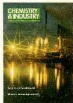
Cover photograph: Cleanaway's high temperature incinerator, Cheshire