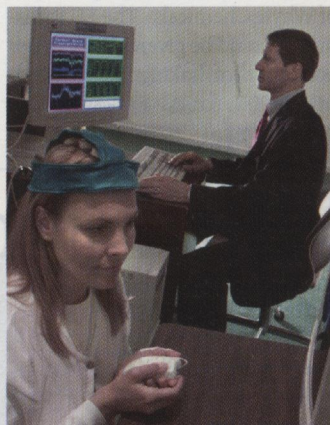
The Gazette/buzz Or