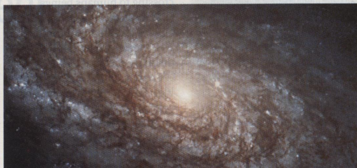
Hubble Heritage Team (AURA/STScI/NASA)

Cover illustration: NASA, ESA, S Beckwith (STScI) & HUDF Team