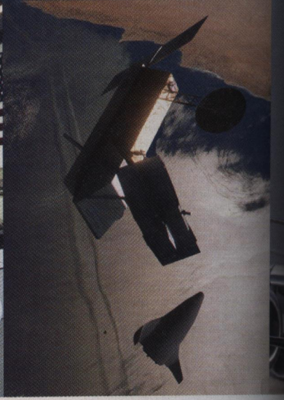
54 Space-Based Radar satellite will be node in systems-of-systems.