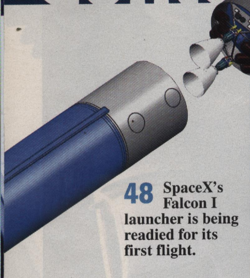
48 SpaceX's Falcon I launcher is being readied for its first flight.