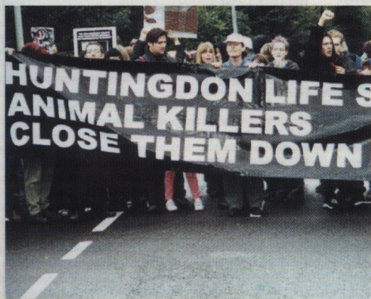
Activists: crusaders or terrorists? pp67 & 70