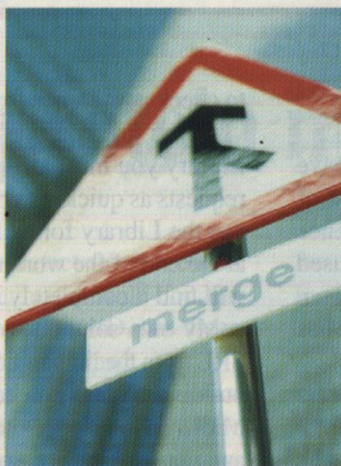
The route ahead for chemical companies, p148