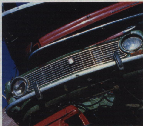
EC encourages consumers to take responsibility, p98