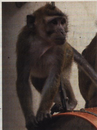
Macaques represent 0.2% of animals used in research, p103