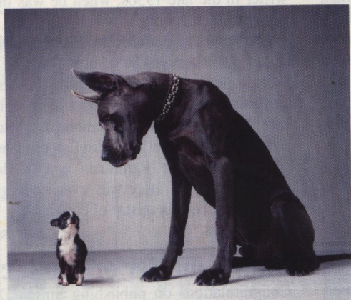
Opposites attract? Ionic liquids, p532