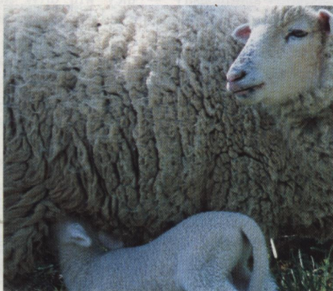
Healthy fat, p729