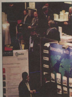
Annual Meeting . . .