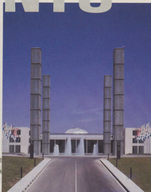
global news . . .

section notes Online at www.ceramicbulletin.org/section.asp