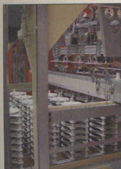
manufacturing briefs . . .