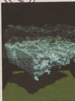
Materials Characterization & Analysis...