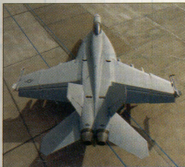
F414 will power USN F-18E/F