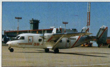
NAPO expects 95 sales in the near term