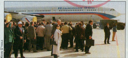
Russian Aerospace '97 delegates at Zhukovskiy