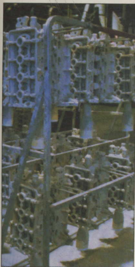
Refractory Helps Cure . . .