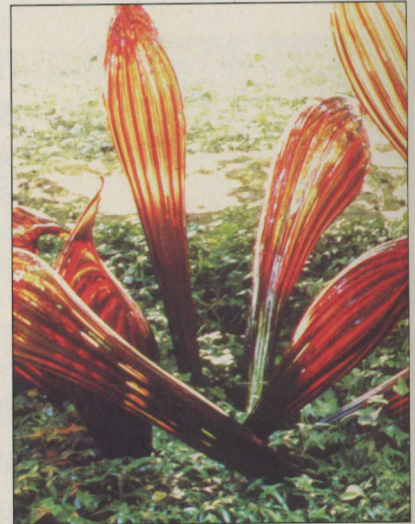
global news . . .