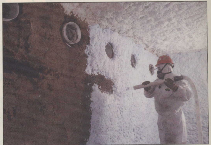
product news . . .

THE AMERICAN CERAMIC SOCIETY BULLETIN covers news and activities of the Society and its members, includes items of interest to the ceramic community, and provides the most current information concerning all aspects of ceramic technology, including research and development, manufacturing, engineering and marketing.