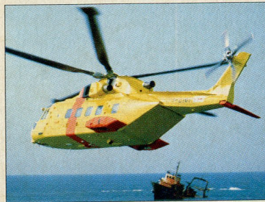
EH101 Cormorant will soon head for Canada