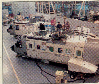
Helibus prototypes are nearly complete