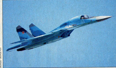
Su-27B: earmarked for multirole missions