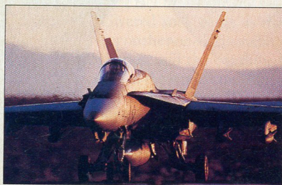
F-18: an option on Philippines shopping list

Philippines hesitates on fighter .... 22