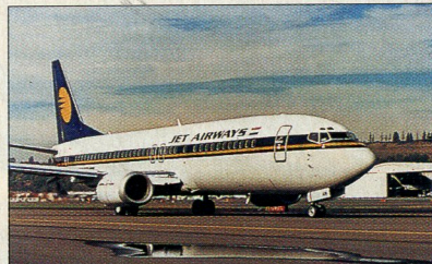
India's Jet continues to receive 737s