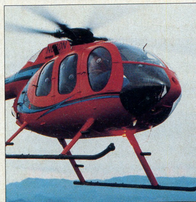
MD 600N is close to upgrade approval