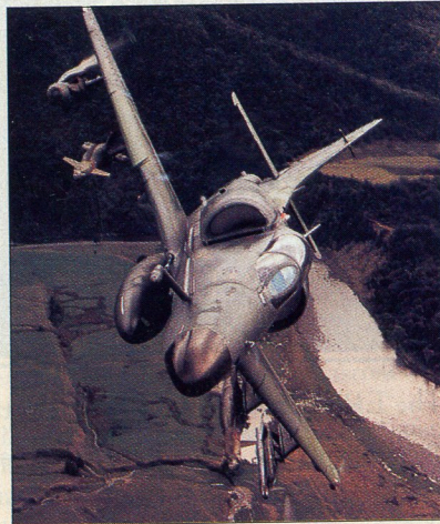
RNZAF A-4s are in line for laser designers

Boeing/Westland win UK Apache training deal