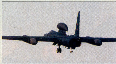
U-2 could still be in service for its 60th birthday