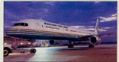
Boeing pioneers new territory with 757-300