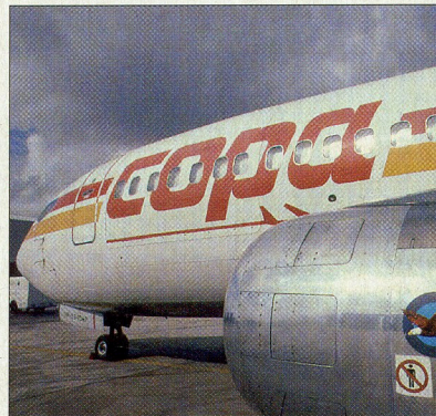
COPA will relinquish its older 737s