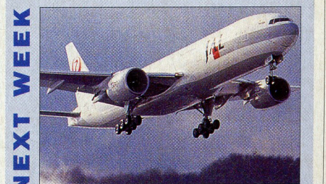
Facing the emergence of new domestic carriers and intensified international competition, Japan Airlines rethinks its future.