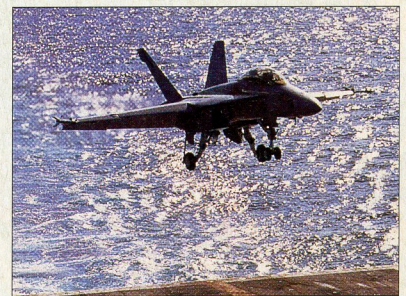
E/F will get a technology block upgrade in 2005