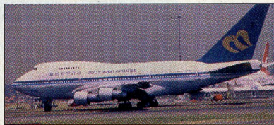
Mandarin 747SPs are to be sold this year