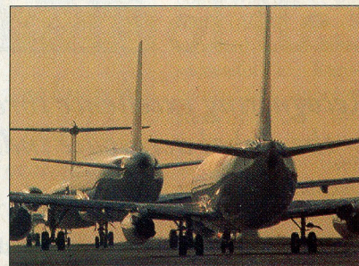
Aircraft are being equipped for new flight levels