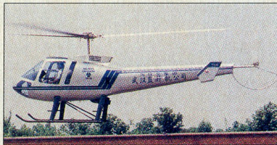
Enstrom discussions with China left in mid-air

Pilot error still US accident culprit 24 Archedyne redesigns amphibian business jet R-R shelves 250 successor plans ... 25