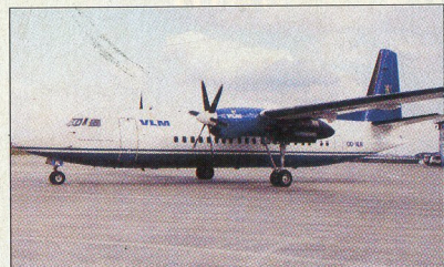
VLM: new colours on Channel Islands routes