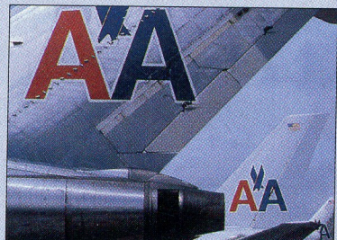
The Top 50 airlines - will American Airlines stay on top?