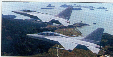
KTX-2 is cleared for detailed design

Delayed KTX-2 gets through design review