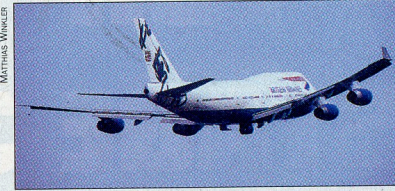
Single-winglet 747 comes into Heathrow