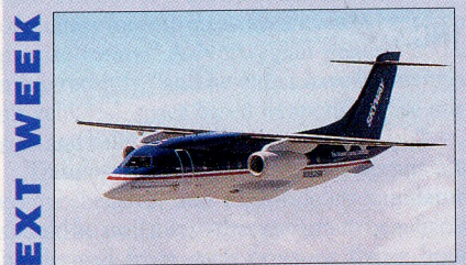
Graduating to turboprops from turboprops, the 328JET is re-engined and raring to go.