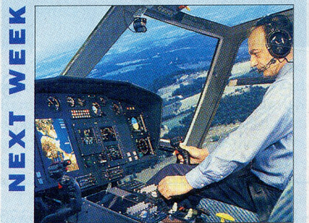
The military avionics industry takes on the new market conditions of a changing world.