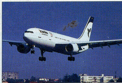
Iran Air received two A300-600Rs in 1994