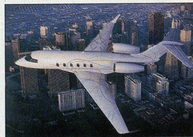
Continental progress for Bombardier