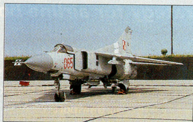
MiG-23s will probably be replaced by F-16s