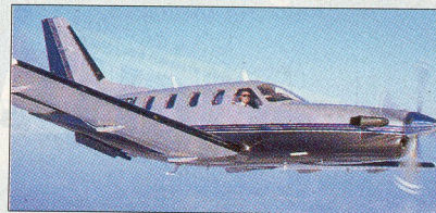
Demand is rising for Socata's TBM 700