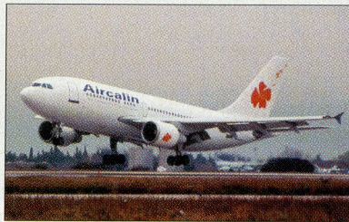
Aircalin expands international services – P14