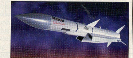
Spain wants its own missile industry (see below)