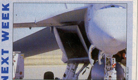
Next week: Test pilot Michael Gerzanics puts the Boeing F/A-18F through its paces in an intense Flight International flight test.