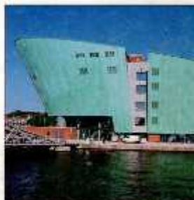
Renzo Piano, New Metropolis Amsterdam