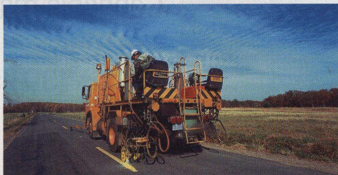
Form & Haas