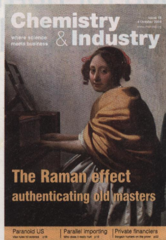
The Raman effect authenticating old masters