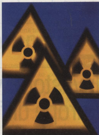
European Community 2004

Cover illustration: Ciba Specialty Chemicals