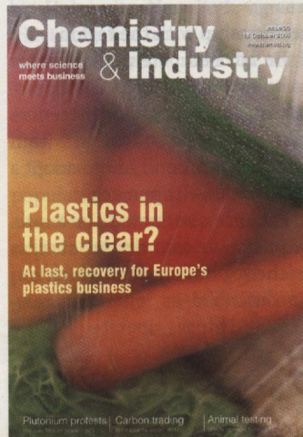
Plutonium protests | Carbon trading | Animal testing

Cover illustration: Ciba Specialty Chemicals