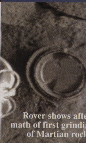
Rover shows aftermath of first grinding of Martian rock

www.Aviationnow.com/awst FREE TO SUBSCRIBERS For the complete current issue, archives and more, go to: www.Aviationnow.com/awst