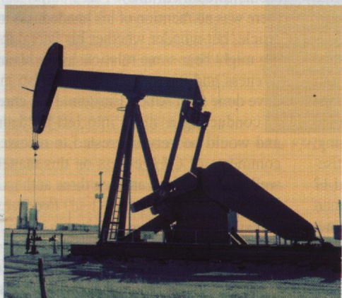
US state science funding dries up, p200