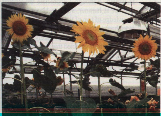
BASF aims for growth through crop protection, p202