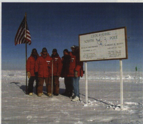
Scientists find more free radicals in Antarctica, p463