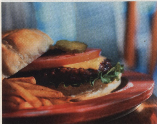
Zyban cures all addictions, p600