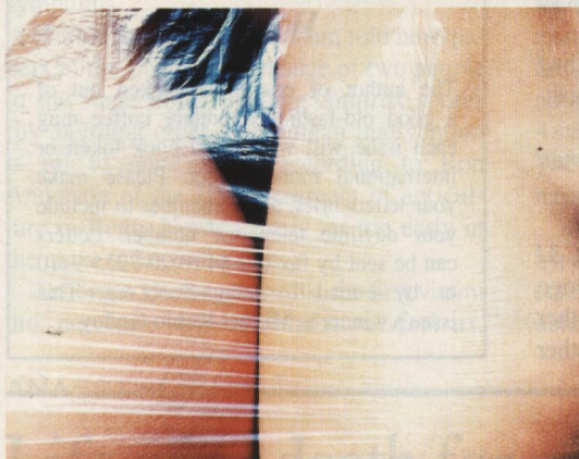
Toxin-alert cling film, p644