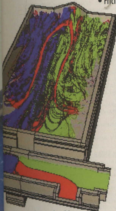
mathematical modeling ...